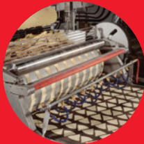
Fresh masa ready for production of quality corn products