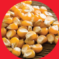
Clean dry corn

The Masa Maker is the world's first corn masa making system that creates fresh, high quality masa in a fraction of the time compared to traditional systems. From dry corn to fresh masa in minutes not hours, Masa Maker applies a patent pending technology to varying corn types to make a variety of corn masas that do not require cooking, simmering, or soaking.